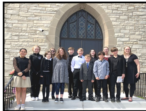
Our Children's Choir participated at the Good Friday TreOre service at Messiah Lutheran Church.