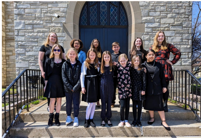
Choir students who sang at the 86th annual Tre-Ore Service at Messiah Lutheran Church on Good Friday.

https://calendar.google.com/calendar/u/0/embed?src=stjohnschicago.org_3kd8tsre0nrk2pd04e975krv4@group.calendar.google.com&ctz=America/Chicago